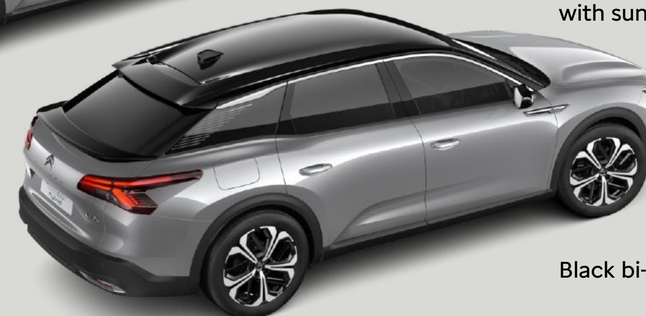
Black bi-tone roof