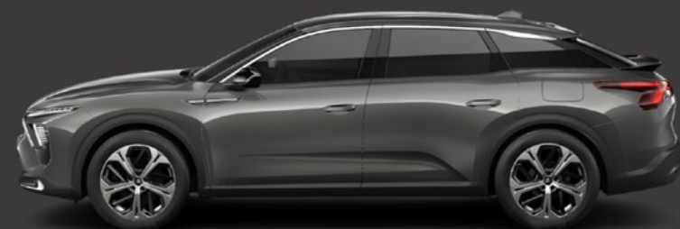
Platinum Grey (M)