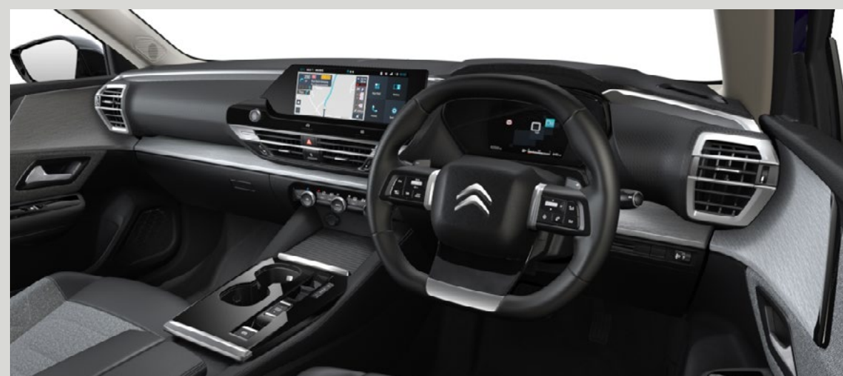
Metropolitan Grey ambience Standard on PLUS.