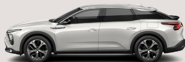
Pearl White (P)