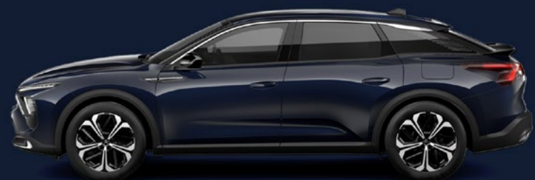
Eclipse Blue (M)