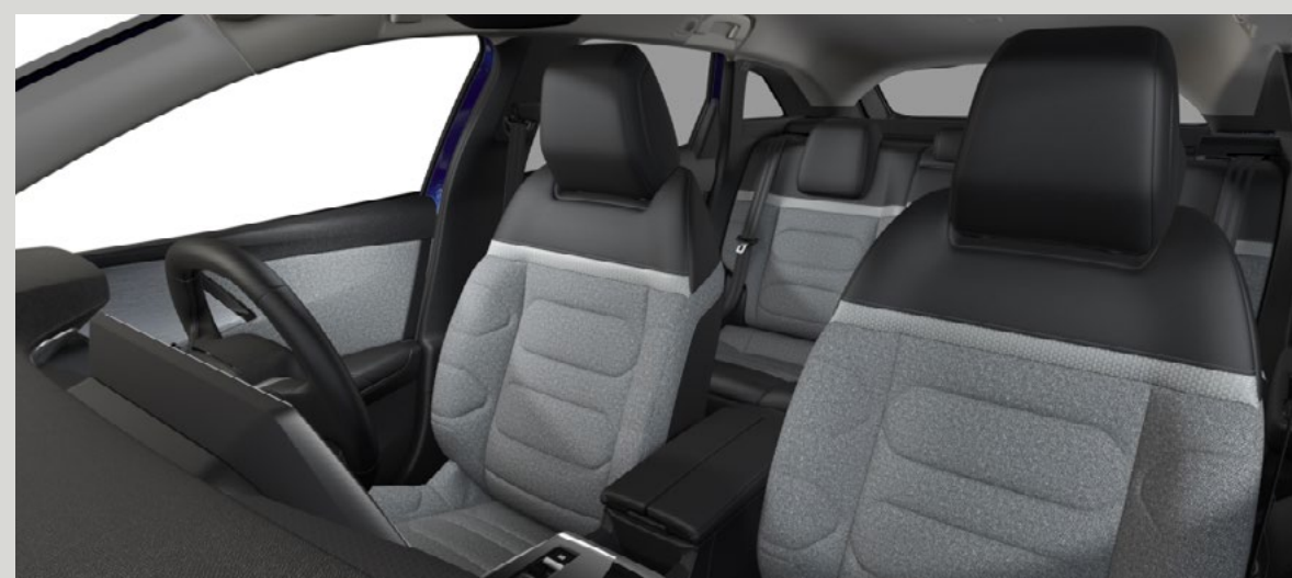
Urban Grey ambience Standard on YOU!