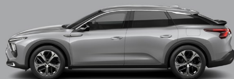
Cumulus Grey (M)