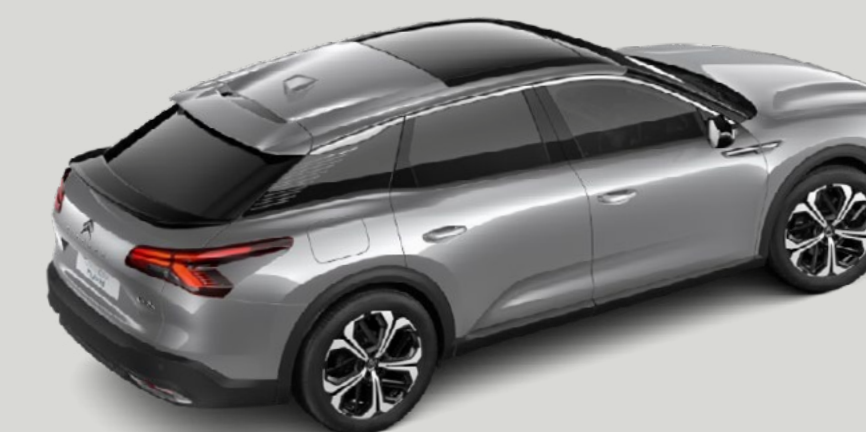
Opening panoramic roof with sunblind