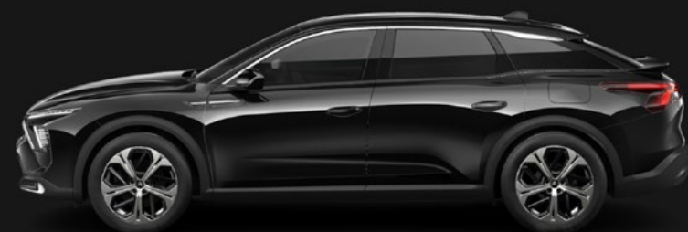
Perla Nera Black (M)