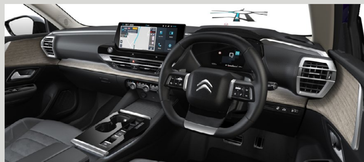
Hype Adamantium ambience Optional on MAX.