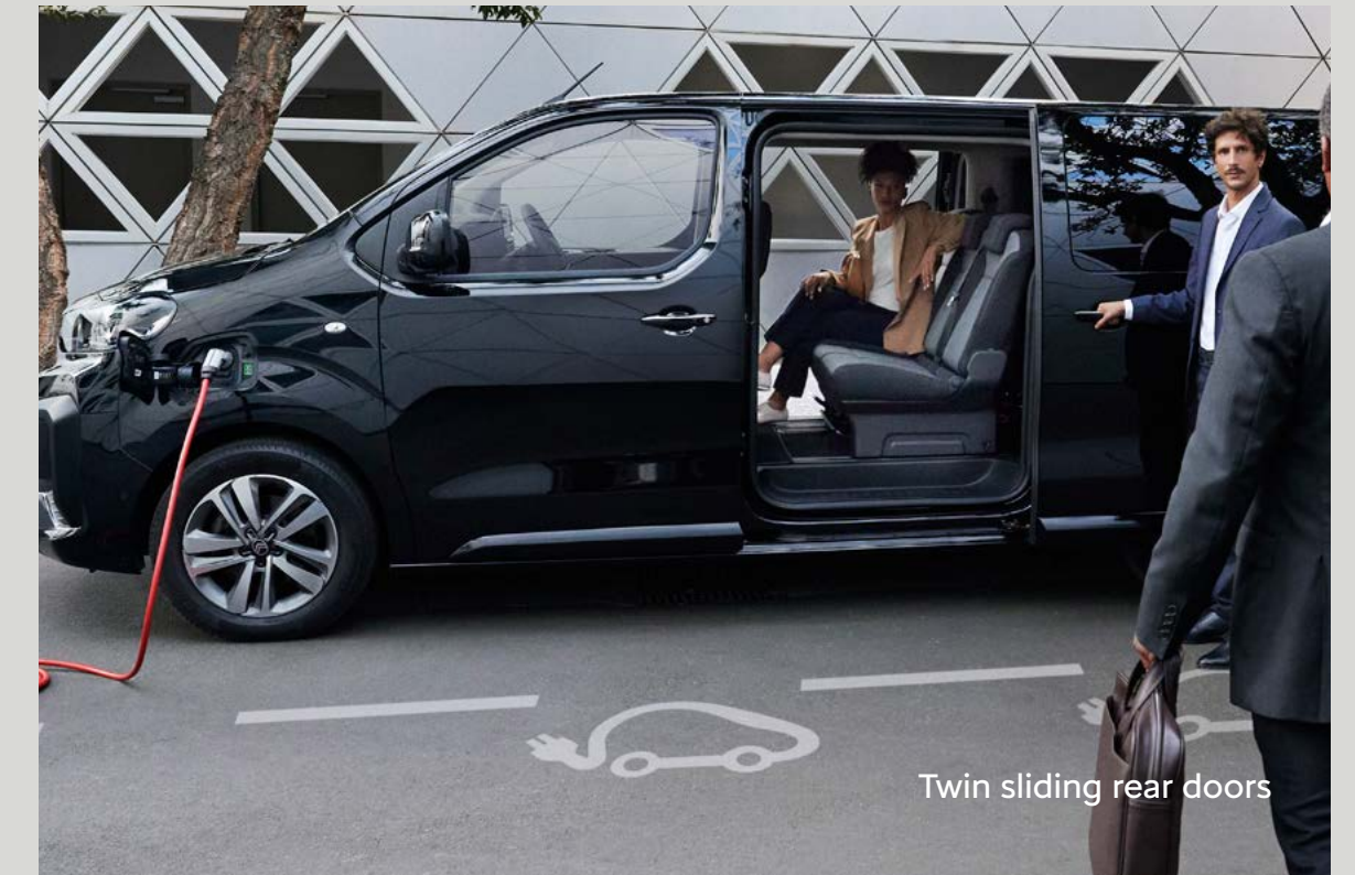
Twin sliding rear doors