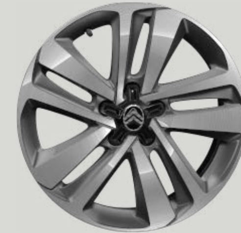
17" Diamond-cut 'Phoenix' silver & black alloy wheels