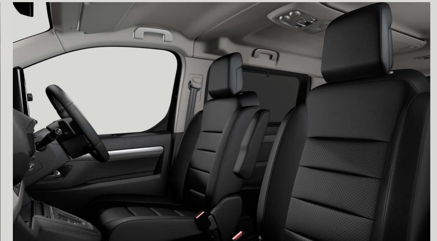
Claudia leather seat trim