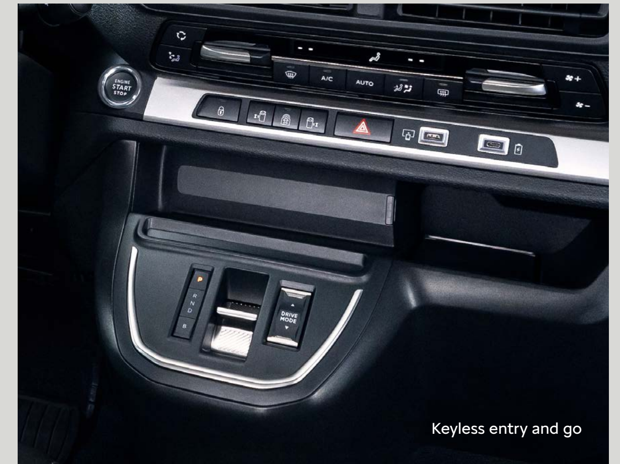
Keyless entry and go