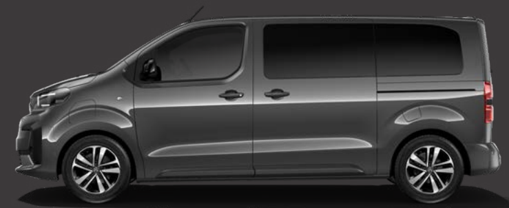
Titanium Grey (M)