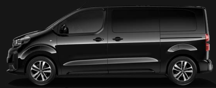
Perla Nera Black (M)