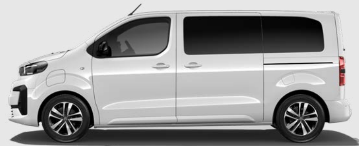
Icy White (F)