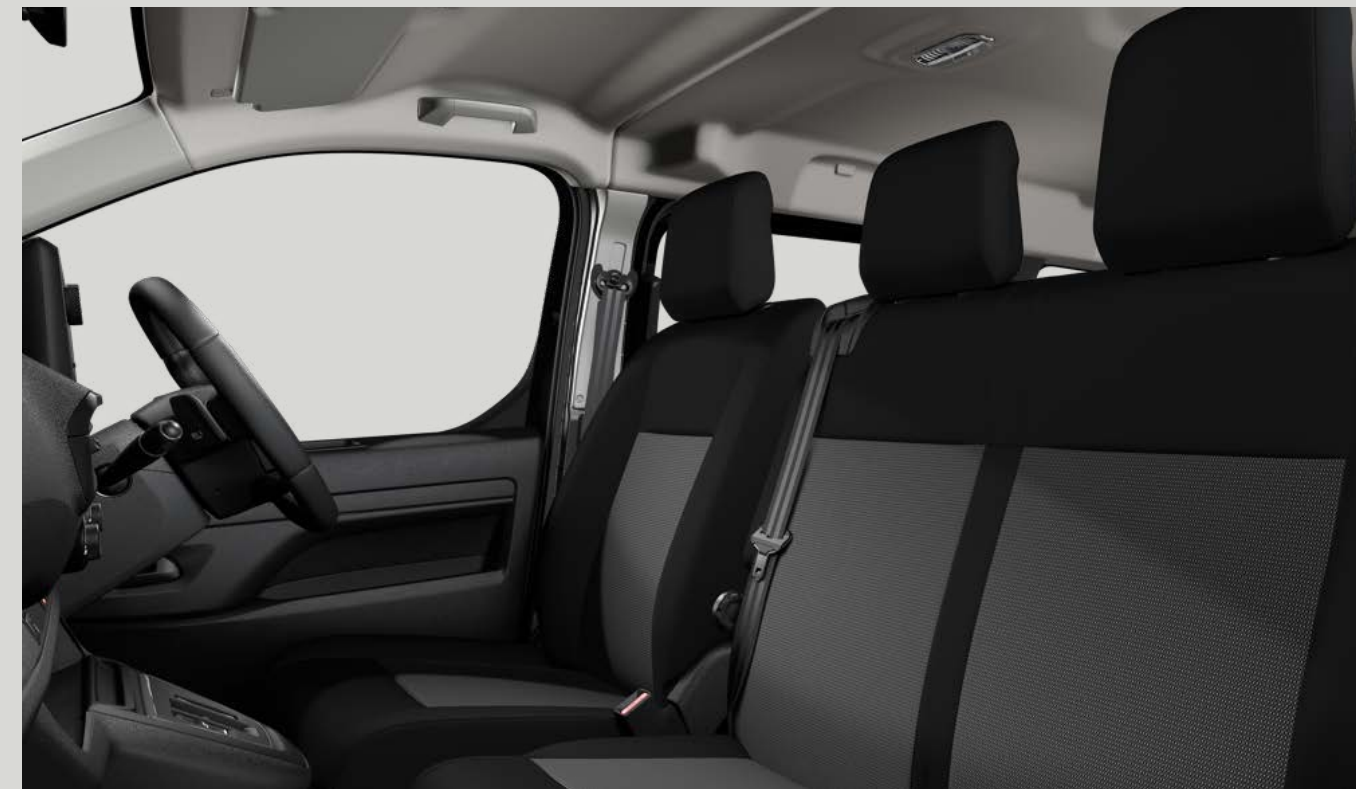
Half Curitiba & Half Brazilia cloth trim