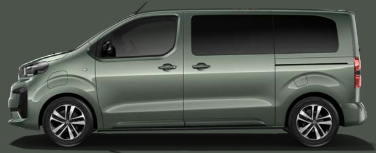
Kapari Green (M)*