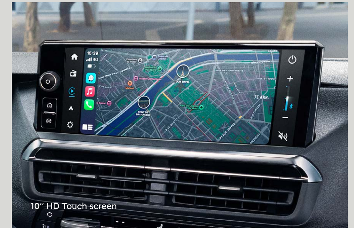
10" HD Touch screen