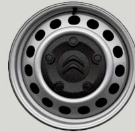
16" inch steel wheels with black hub cap