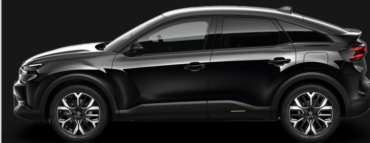
Perla Nera Black (M)