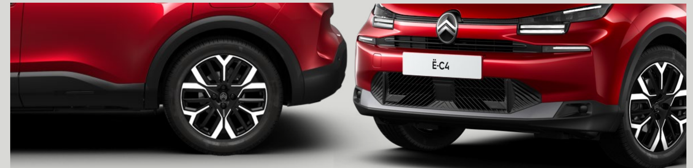
Glossy Black (standard on YOU! and PLUS)

Depending on the trim level chosen, your C4 features Colour Clips in the front lower bumper and on the rear side doors