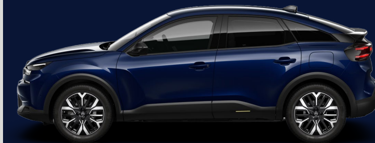
Eclipse Blue (M)