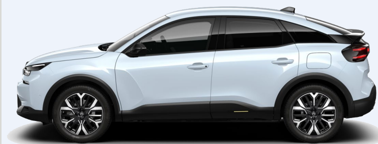
Okenite White (M)