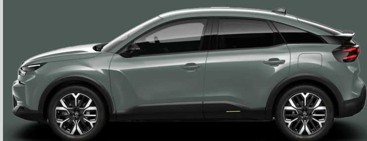
Manhattan Green (F)