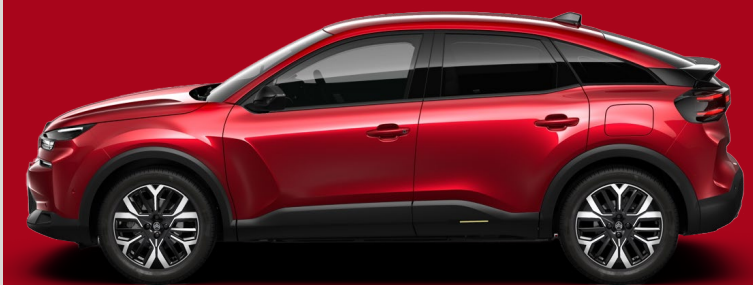
Elixir Red (PM)