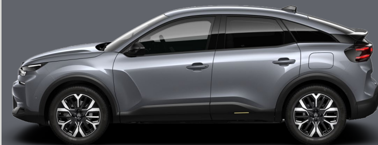
Mercury Grey (M)