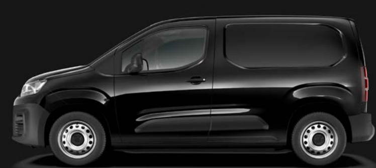
Perla Nera Black (M)