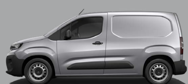
Cumulus Grey (M)