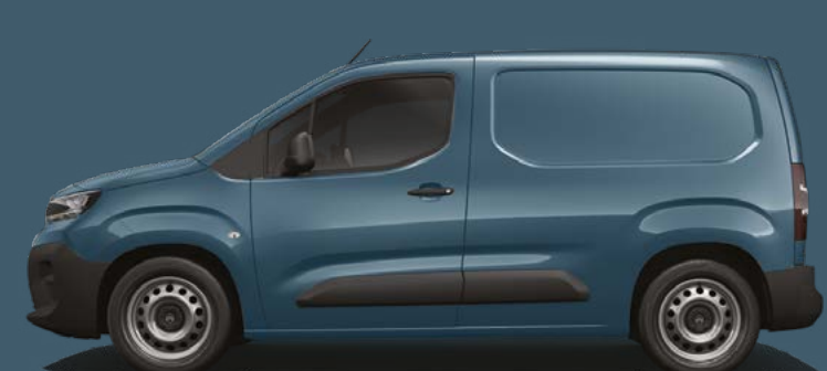
Kiama Blue (M)