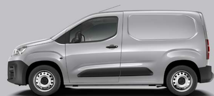
Arctic Steel (SP)*