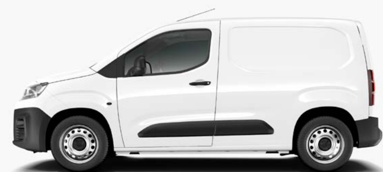
Icy White (F)